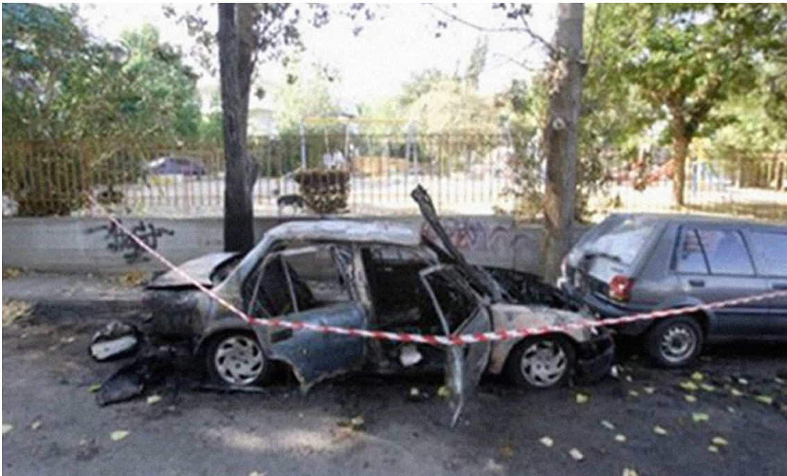
The burnt out get-away car.

press conference giving new information about the investigation, revealing that witness testimony suggested that a motorcyclist had been watching the journalist's house during the ten days leading up to the murder. 100 The police also announced they were looking for evidence to determine whether five individuals previously linked to (but not convicted for) attacks by the Sect of Revolutionaries were responsible for the murder. 101 Police announced they were examining Giolias' publications, and looking into the threats made against him. The police also noted that they were awaiting a public declaration from the Sect claiming the murder. 102