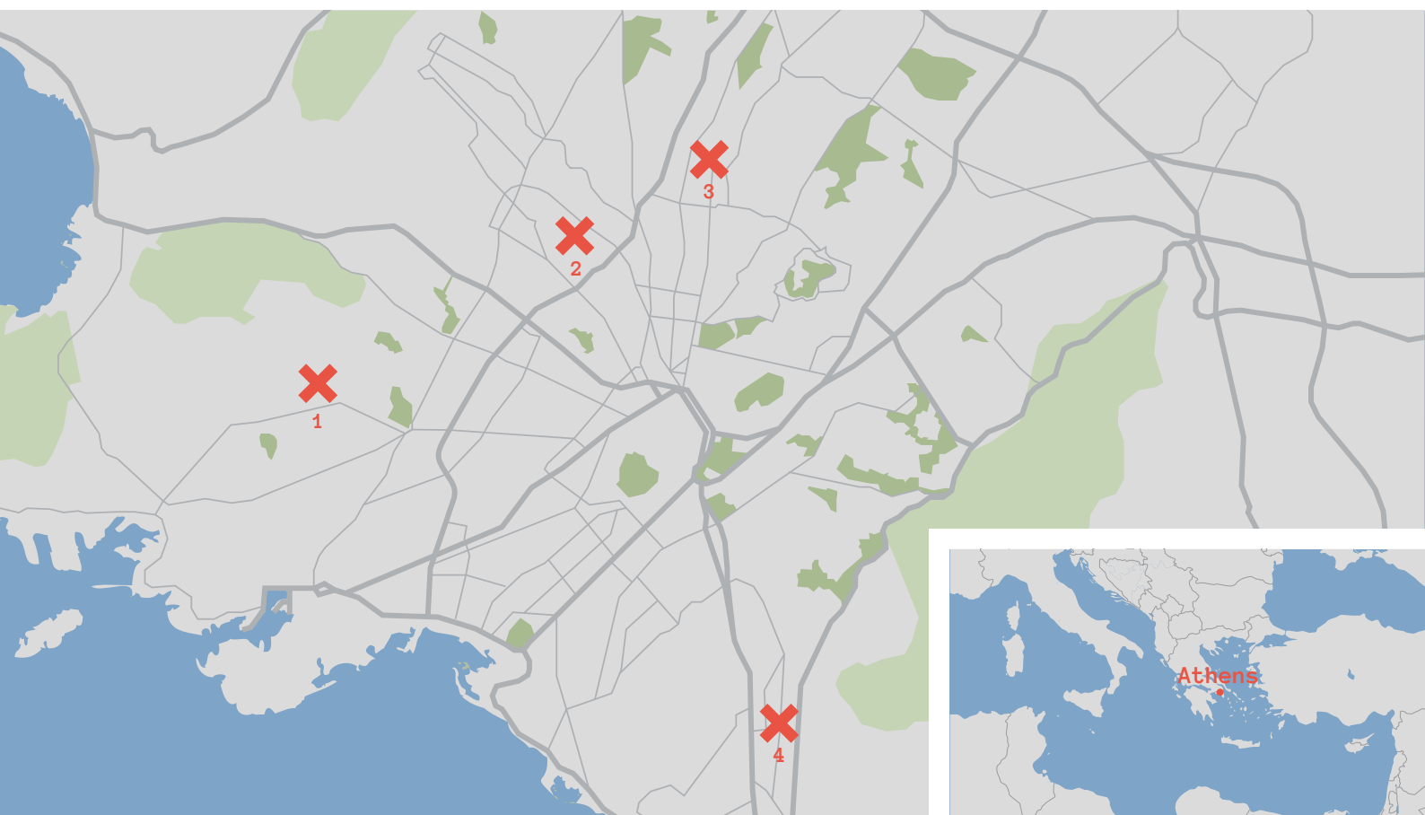
Locations of the attacks claimed by the Sect of Revolutionaries.